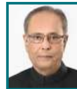
Shri Pranab Mukherjee Hon'ble President of India

“There is a high variance in the quality of service available as well. Some private hospitals provide world class facilities, so much so that people from third countries come here for treatment giving impetus to medical tourism. On the other hand, is the lack of access to even basic medical care for many people particularly the poor and disadvantaged. Our medical healthcare system has to be developed to cater to medical requirements of all sections of society, both in rural and urban areas.”